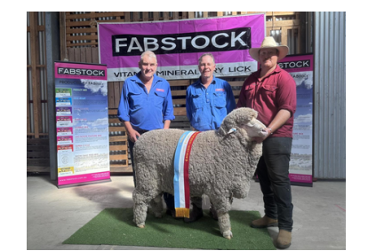
WIMMERA AUTUMN MERINO SHEEP SHOW

Once again, the year concluded with the Fabstock Wimmera Autumn Merino Sheep Show. Featuring a fantastic display of merinos and poll merinos from across the state, this competition is highly esteemed by studmasters and woolgrowers alike. The event was organized by the Wimmera Merino Sheep Breeders Association, alongside our dedicated staff and several councillors.