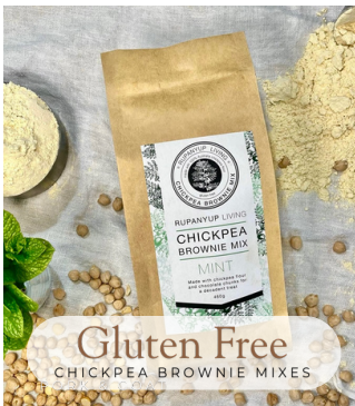
Gluten Free CHICKPEA BROWNIE MIXES