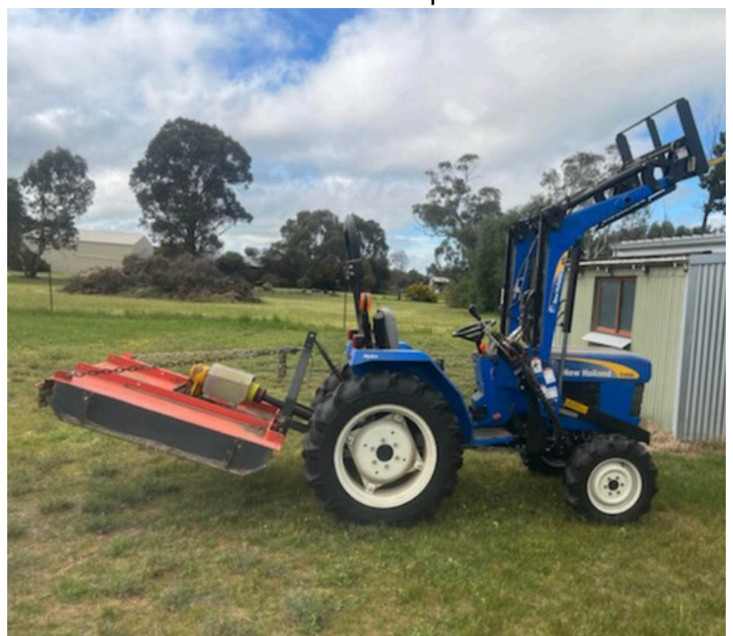
Out with the old and in with the new! The old Fergie comes out at Show time!