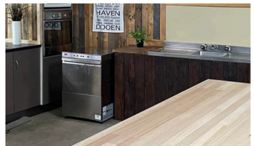
The dishwasher in place in the kitchenette